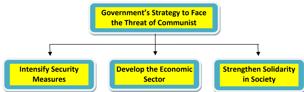
Figure 2 Government's Strategy to Face the threat of Communist in the Country