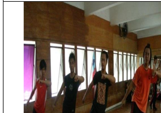
Plate 7: Variation of hand movement