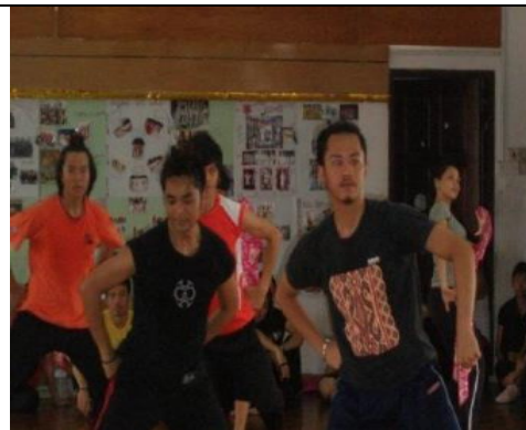
Plate 8: Variation of hand movement