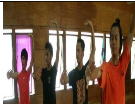
Plate 6: Variation of hand movement