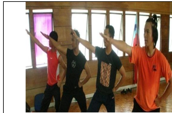
Plate 5: Variation of hand movement