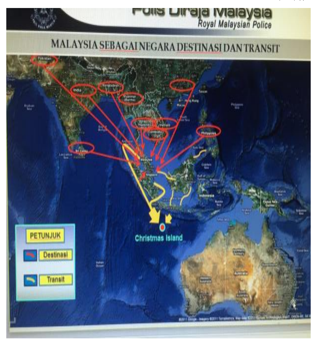
Figure 1. Malaysia as a destination and transit country